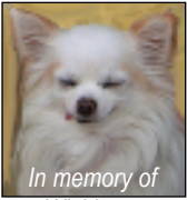
In memory of Wishbone

WELCOME to "Stitch in Time," the newsletter for Spay and Neuter Solutions! We hope to keep you and our many other friends updated on our activities and our progress in addressing the challenge of pet overpopulation in southern Arizona.